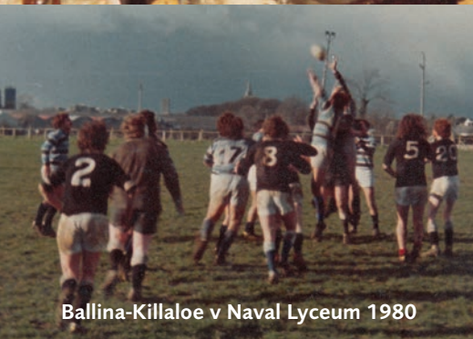
Ballina-Killaloe v Naval Lyceum 1980