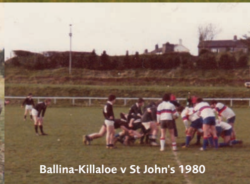
Ballina-Killaloe v St John's 1980