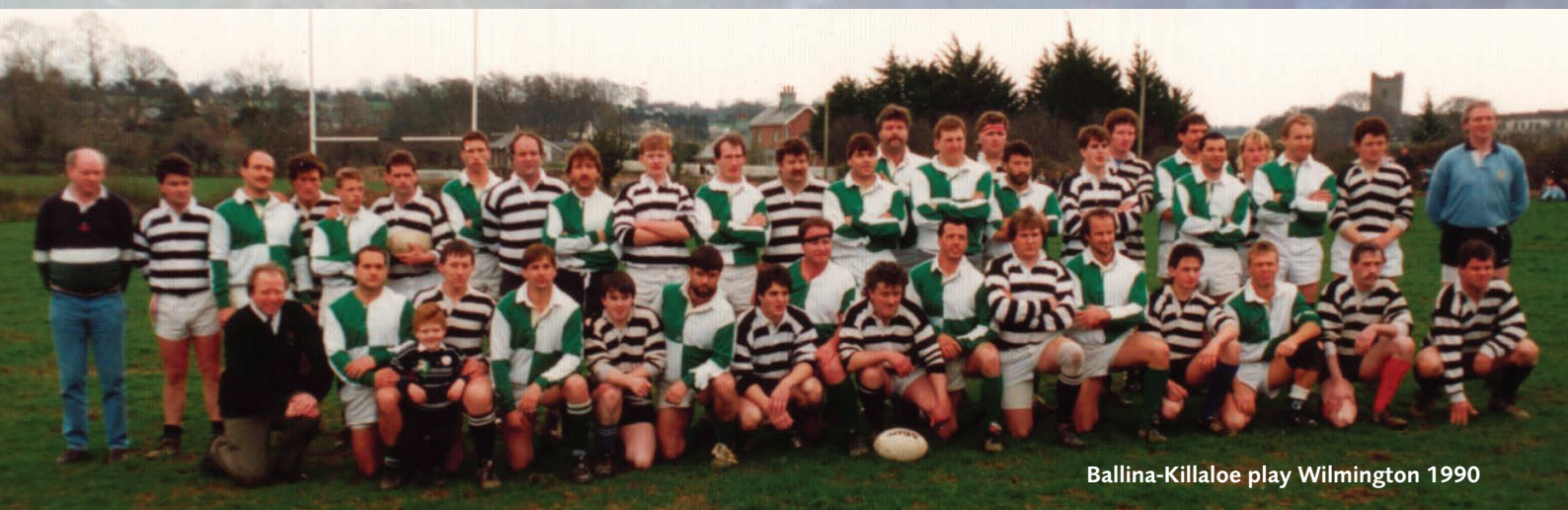
Ballina-Killaloe play Wilmington 1990