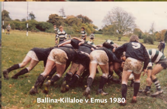
Ballina-Killaloe v Emus 1980